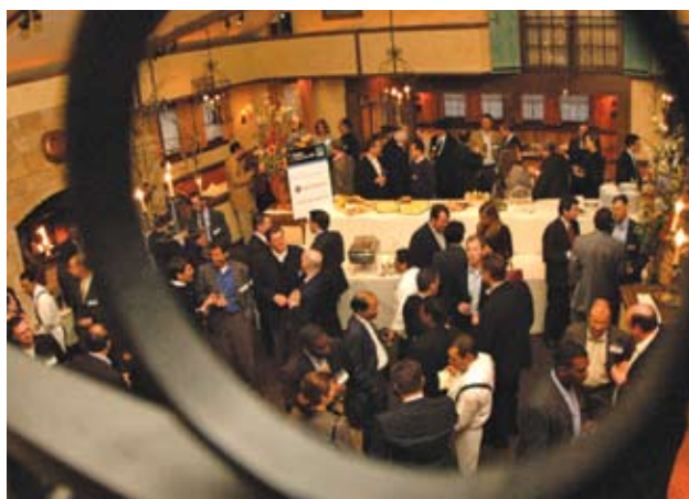
BOTTOM , Plenary session at Mid-Atlantic Bio