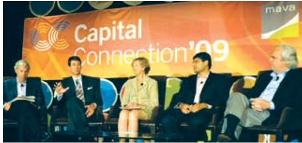
TOP , Cleantech panel on the “smart grid”