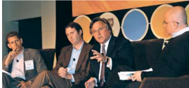
BOTTOM , Media panel on new online models